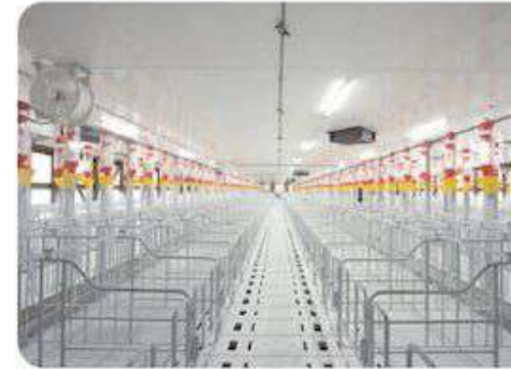
Sueyoshi Farm (Bleeding Farm)